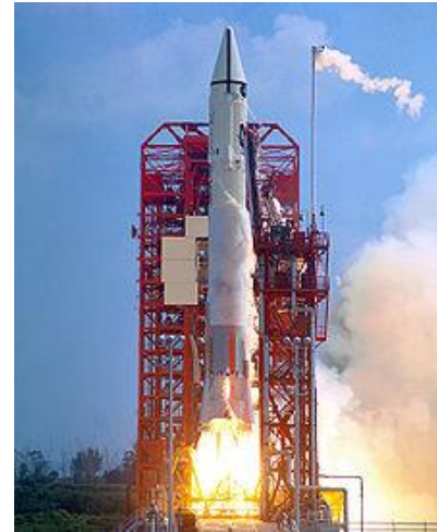
Atlas-Centaur with Surveyor 1

The project was carried out by the Jet Propulsion Laboratory (JPL) which selected the Hughes Aircraft Company to develop the spacecraft systems.